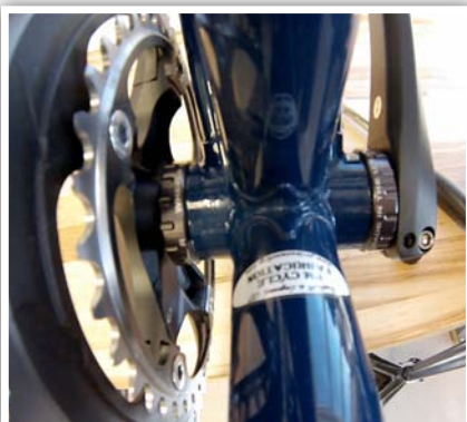
10. Add spacers as necessary to take up any play, remove spacers as necessary if binding occurs.

NOTE: Due to the wide variety of frame manufacturers, Wheels Manufacturing cannot guarantee compatibility with all frames. Please consult with your specific frame manufacturer before installation. Wheels Manufacturing is not responsible for damage done to your frame as a result of installation or use of this product.