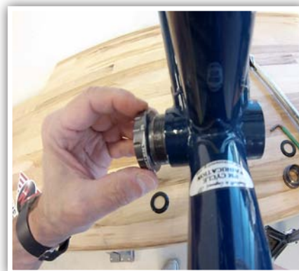
3. Insert drive side cup and center sleeve into frame.