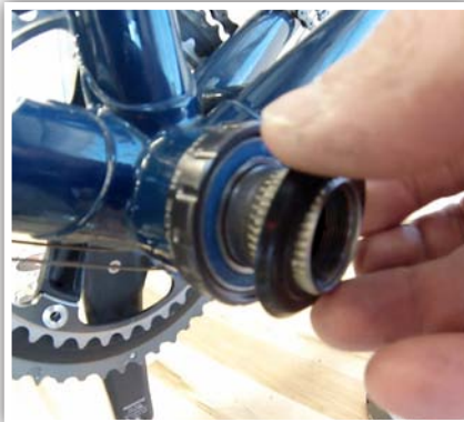
8. Make sure outer dust seal is in place before installing left crank arm.