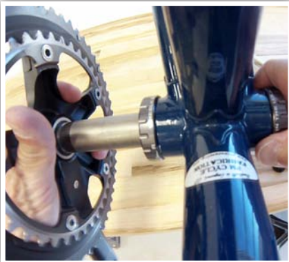
7. Install right crank arm, making sure outer dust seal is installed.