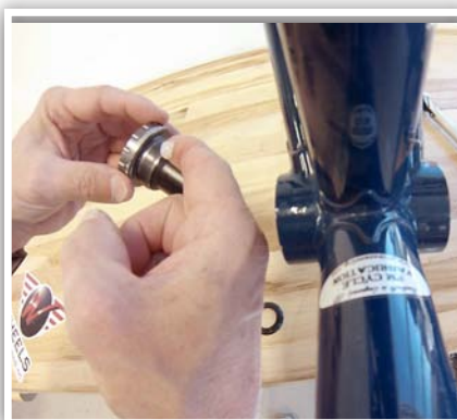
2. Apply a thin layer of grease to cup.