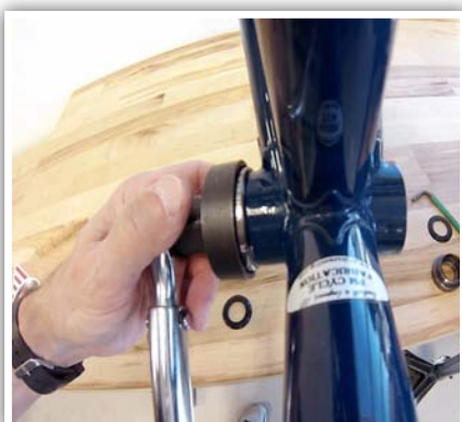
4. Use Park Tool BBT-69 to thread drive side cup into frame until flush. Using torque wrench, fully tighten to 35-50Nm.