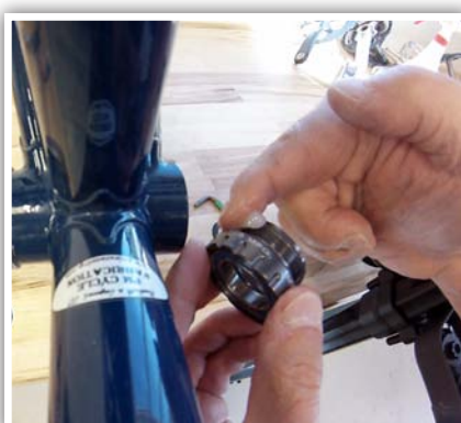
5. Apply a thin layer of grease to cup.