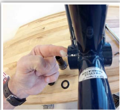
1. Thoroughly clean the bottom bracket shell. Apply a thin layer of grease to inner shell.

IMPORTANT: Thoroughly clean the bottom bracket shell and apply a layer of high quality grease to mating surfaces before installation. DO NOT use any brand bearing retaining compounds or epoxies during installation, use of which will void any warranty.