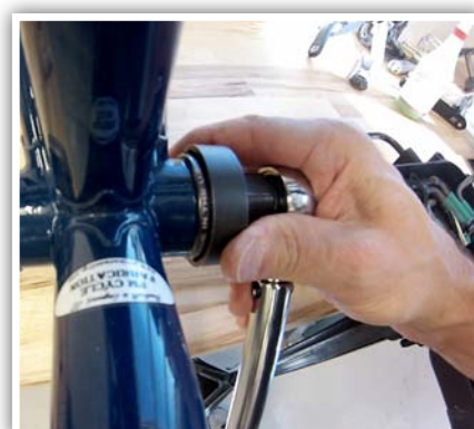
6. Use Park Tool BBT-69 to thread non-drive side cup into frame until flush. Using torque wrench, fully tighten to 35-50Nm.